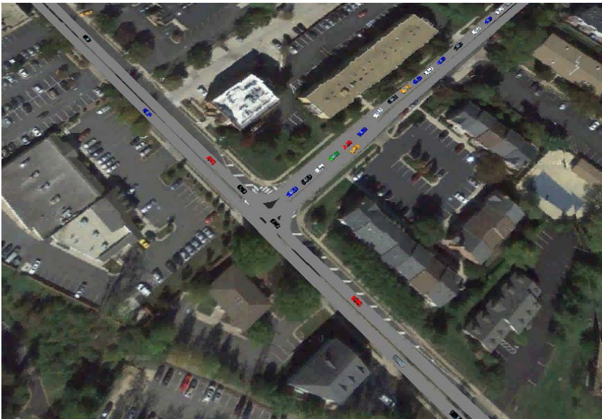
← No Build, TWSC