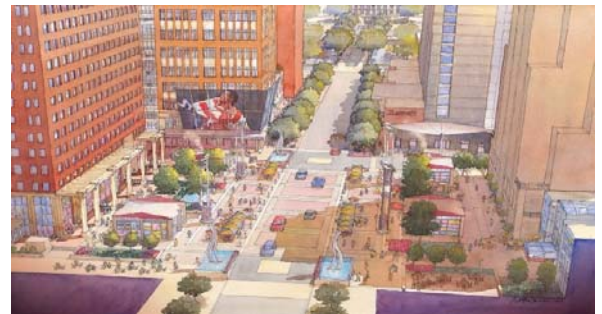
Fayetteville Street Rendering by Kimley-Horn