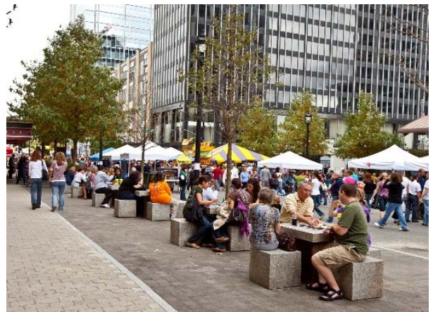
Fayetteville Street